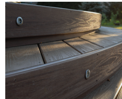
*Special Order Colors